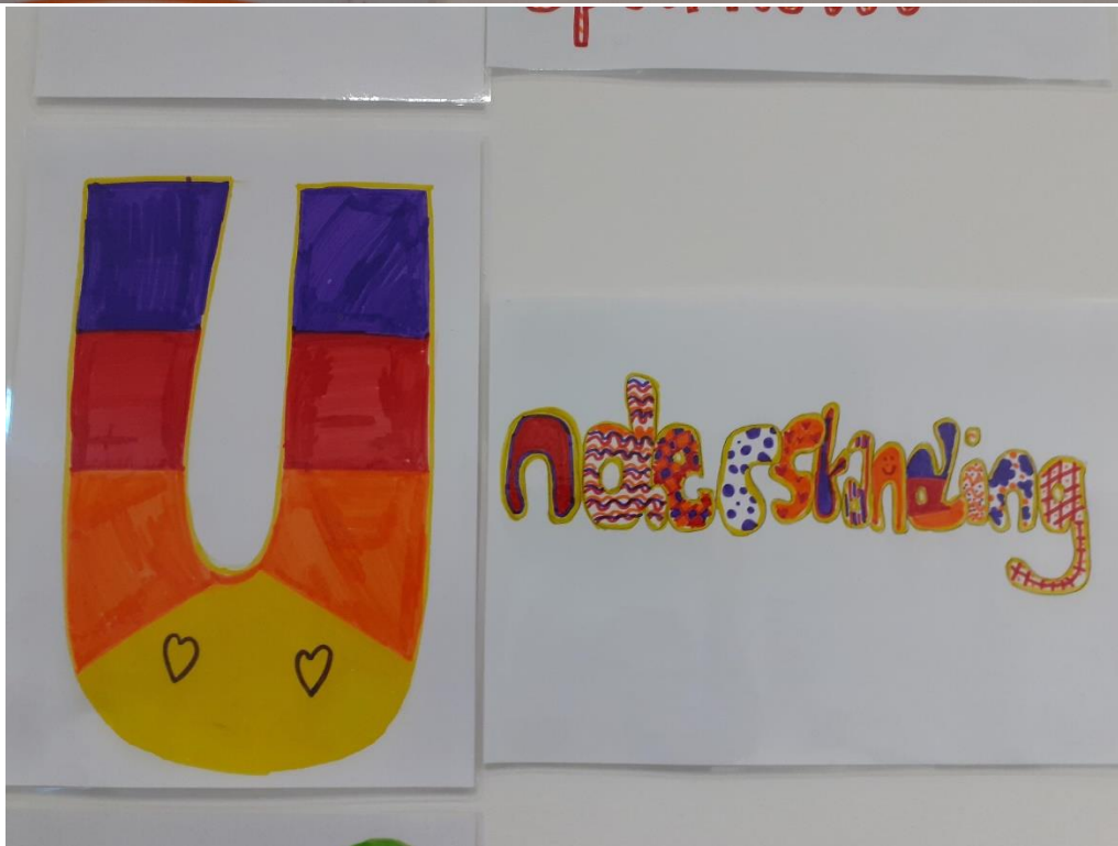
Figure 1 Arts Works created by The Young Carers Group